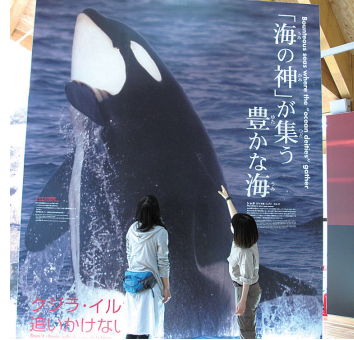
Life-sized animal photograph display.