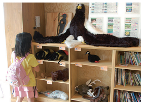
Hands-on learning made fun, with life-sized stuffed animals and more.