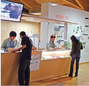
The Information Desk provides seasonal nature information.

The Shiretoko World Heritage Conservation Center displays life-size photos of brown bears, sika deer and other animals living in Shiretoko, and models of claw marks of brown bears and other traces left by animals. It also showcases the magnificence of Shiretoko's nature and gives rules that must be observed by visitors. It provides real-time information on the sights and nature of the Shiretoko World Heritage site and the latest information on the management of the site.