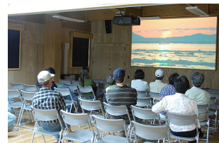
Learn about Shiretoko through movie presentations in the Lecture Room.