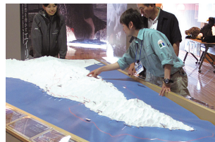
1:25,000 scale relief map highlights points of interest around Shiretoko.