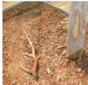
Models of traces left by animals (sika deer antler rubbings on tree bark and more).