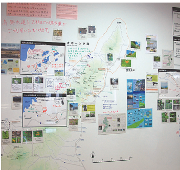
The Information Board allows visitors to check footpath and road conditions, as well as ship arrival and departure schedules.