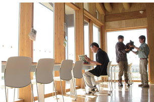
Enjoy a break while reading books about Shiretoko at the Rest Area.